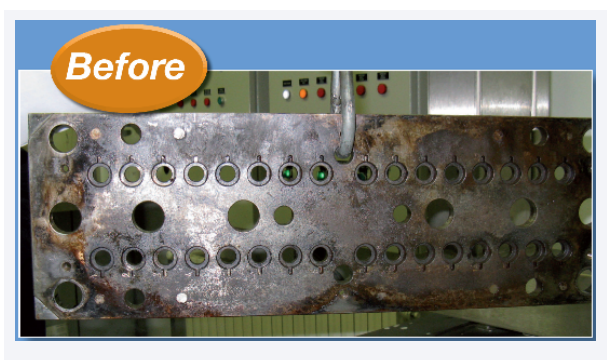
Mold plates for plastic caps before FISA cleaning

On studying an ultrasound seller's catalogue, one can typically buy an ultrasound tank to clean molds and tools in. But cleaning a mold often implies removing rust, lime scale or other residue.