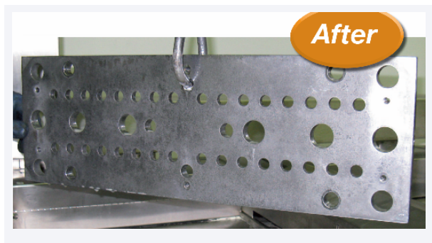
Mold plates for plastic caps after FISA cleaning

To wash their hands, people use soap and then they must rinse them to get rid of the soap. This is why FISA machines generally follow the 'three stations principle': washing, rinsing, maintenance/drying.